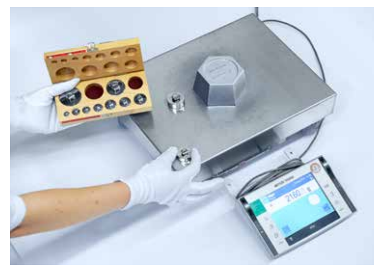
Calibration of the used balances

The information of the certificate is in accordance with ISO 6141 (Gas analysis - Requirements for certificates for calibration gases and gas mixtures). In reduced form, the certificate is attached as a label to each gas cylinder.